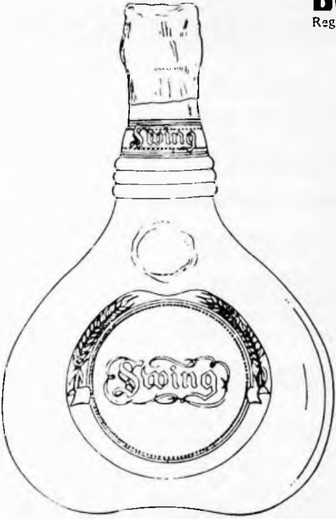
Reg. No. 6964